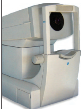
HUMPHREY 599 w/Glare